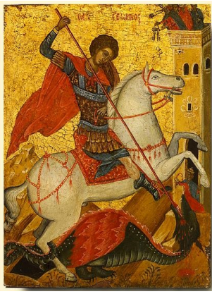
Troparion to St. George

As the deliverer of captives and defender of the poor, healer of the infirm and champion of kings, victorious great martyr George intercede with Christ our God for our souls salvation.