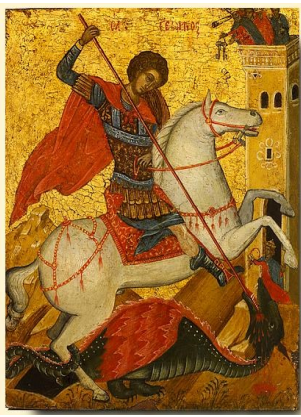
Troparion to St. George

As the deliverer of captives and defender of the poor, healer of the infirm and champion of kings, victorious great martyr George intercede with Christ our God for our souls salvation.