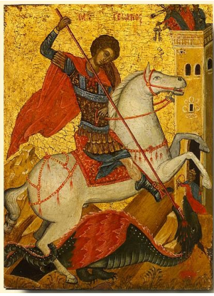
Troparion to St. George

As the deliverer of captives and defender of the poor, healer of the infirm and champion of kings, victorious great martyr George intercede with Christ our God for our souls salvation.