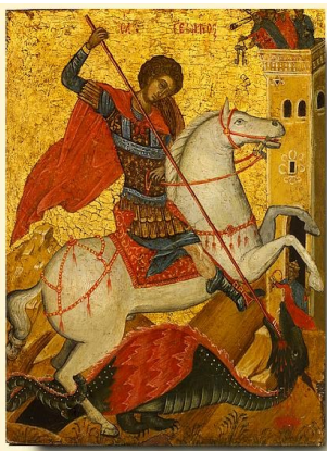
Troparion to St. George

As the deliverer of captives and defender of the poor, healer of the infirm and champion of kings, victorious great martyr George intercede with Christ our God for our souls salvation.