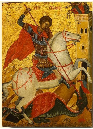
Troparion to St. George

As the deliverer of captives and defender of the poor, healer of the infirm and champion of kings, victorious great martyr George intercede with Christ our God for our souls salvation.